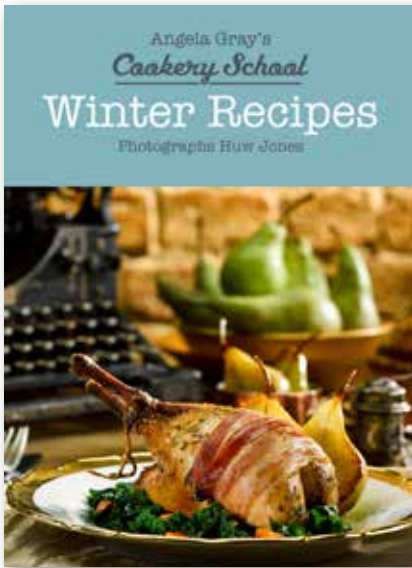
A3 poster 420 x 297mm

Posters in standard sizes as follows can be supplied to account holders. Larger posters and card mounted displays available on request, contact Graffeg Sales.