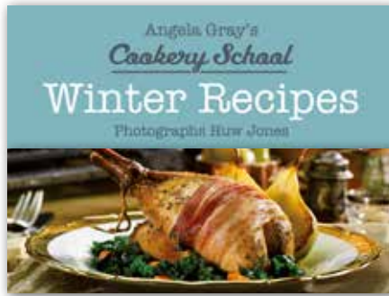
Image files for web and social media use – screen resolution jpegs files available, contact Graffeg Sales.