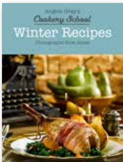
A4 poster 297 x 210mm