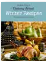
A5 poster 210 x 148mm